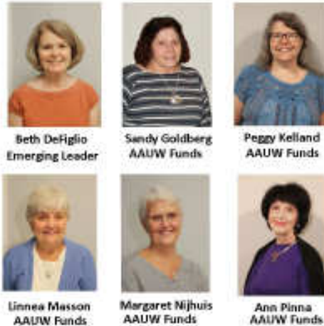
2024 AAUW Honorees