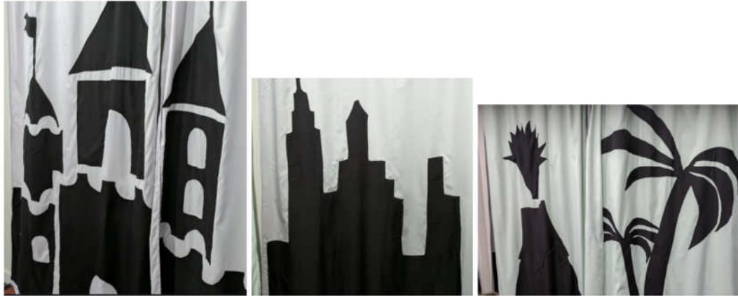
These are curtains on rods that can be pulled open or pushed closed on a single wall.

PLAYSCAPE CURTAINS. Approximately 72" H x 72" W (about the size of a standard size of a shower curtain). An old clean queen sized sheet cut in two is perfect. Preferably choose a plain white cotton/polyester mix so they don't wrinkle. Please sew a pocket at the top for a curtain rod to slide in. Inspirational pix attached but not meant to limit your crafters' imaginations. This sets the stage for kids to imagine life from another perspective.